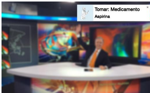
Figure 3. Notification of the reminder while the older adults are watching TV. Source [9].